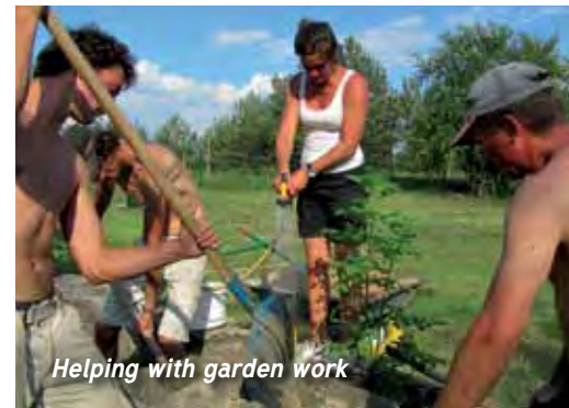
Helping with garden work