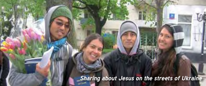
Sharing about Jesus on the streets of Ukraine