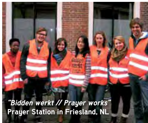
"Bidden werkt // Prayer works" Prayer Station in Friesland, NL